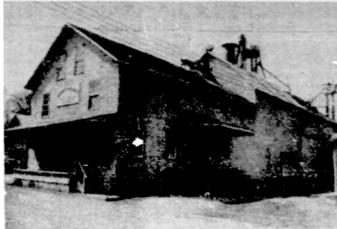
Front View of Medbury-Neilsen Summer '76