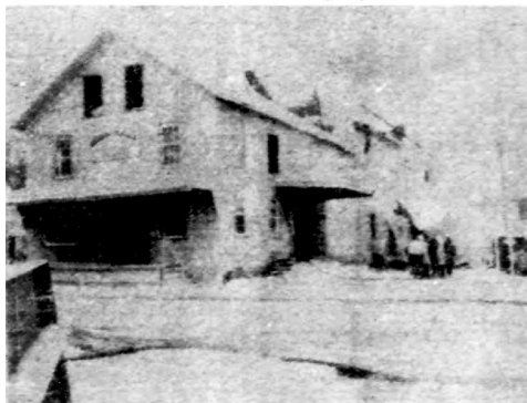
Side Views January 4, 1977